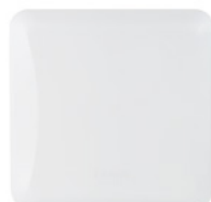
TurboGain slide-on 22dBi antenna