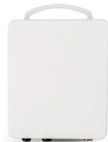
RADWIN 2000 D+ Connectorized