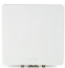
RADWIN 2000 Alpha 16dBi embedded