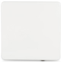
RADWIN 2000 D+ 23dBi

RADWIN 2000 D+ Series radios deliver 750 Mbps