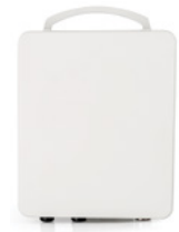
RADWIN 2000 C Connectorized