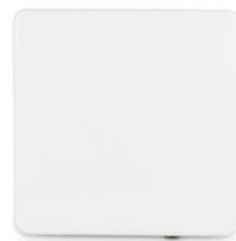
RADWIN 2000 A with 23dBi antenna

Ethernet capacity can easily be upgraded to 100 Mbps via a software key. This assures a low initial investment while securing future capacity growth. RADWIN 2000 A Series is available with a 17dBi or 23dBi integrated antenna or as a connectorized unit.