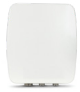
RADWIN 2000 A with 17dBi or Connectorized antenna